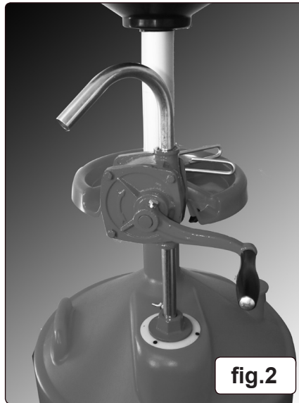
AK80D.V2 shown with TP55 pump (not supplied) fitted into drain port.

5.5.2. Fit a suitable hose to the pump outlet and connect to the waste oil tank. Pump out as necessary.