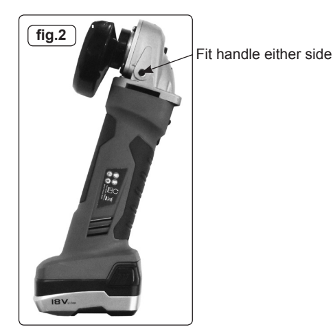
Grinder profile, battery fitted, grinding disc not fitted

I/O Switch, slide fully up to start, press I/O tab end to stop.