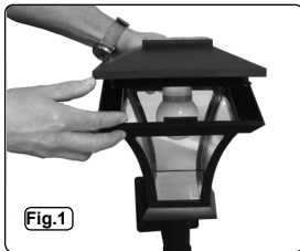
Lamp canopy removal (no tools required)