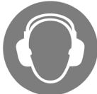
Wear Ear Protection