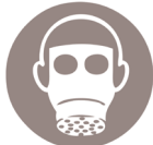
Wear Respiratory Protection