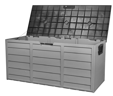
Storage box with lid open