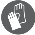
Wear Protective Gloves