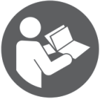
Refer to Instructions

IMPORTANT: PLEASE READ THESE INSTRUCTIONS CAREFULLY. NOTE THE SAFE OPERATIONAL REQUIREMENTS, WARNINGS & CAUTIONS. USE THE PRODUCT CORRECTLY AND WITH CARE FOR THE PURPOSE FOR WHICH IT IS INTENDED. FAILURE TO DO SO MAY CAUSE DAMAGE AND/OR PERSONAL INJURY AND WILL INVALIDATE THE WARRANTY. KEEP THESE INSTRUCTIONS SAFE FOR FUTURE USE.