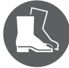
Wear Safety Footwear