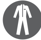
Wear Protective Clothing